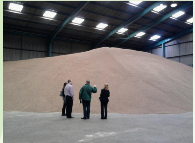
Wood pellet depot, Staffordshire

Following the successful installation of a wood fuelled heating system in Stansted in 2008, a new wood pellet boiler situated in the Fire Station Building of Heathrow Airport is set to be commissioned this month. The boiler is expected to use in excess of 600 tonnes per year and will be supplied with wood pellet fuel through a partnership established between LC Energy, BAA's current biomass supplier and Billington Biofuels, a leading wood pellet distributor. The commissioning of this boiler follows on from a similar installation in the recently redeveloped Terminal 2 building which is supplied with wood chip by LC Energy. Both wood fuelled heating systems have been installed as part of a wider commitment by BAA to reducing its carbon footprint. BAA's ambitious targets seek to reduce CO2 by 34% by 2020, in line with government figures.